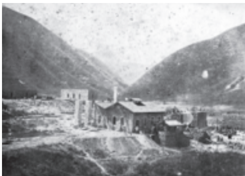
Anatolian railway station.