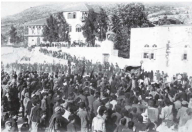
Anti-British demonstration with Turkish 7th Army headquarters in the background.

The captions do not provide the date of the Nablus pictures, but they were surely taken after the fall of Jerusalem in December 1917. One shows a public demonstration against the British occupation of Jerusalem. In the background appears the building that housed the headquarters of the 7th Turkish army.