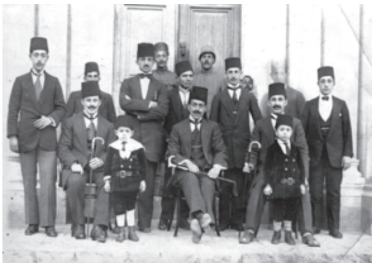
The owners of a building in Nablus where the Turkish army had a laboratory.