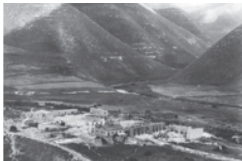
Oil producing facilities at El Maqarin.