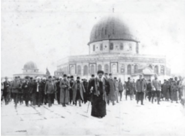
Enver Pasha (left, with religious leaders) visiting the Dome of the Rock.