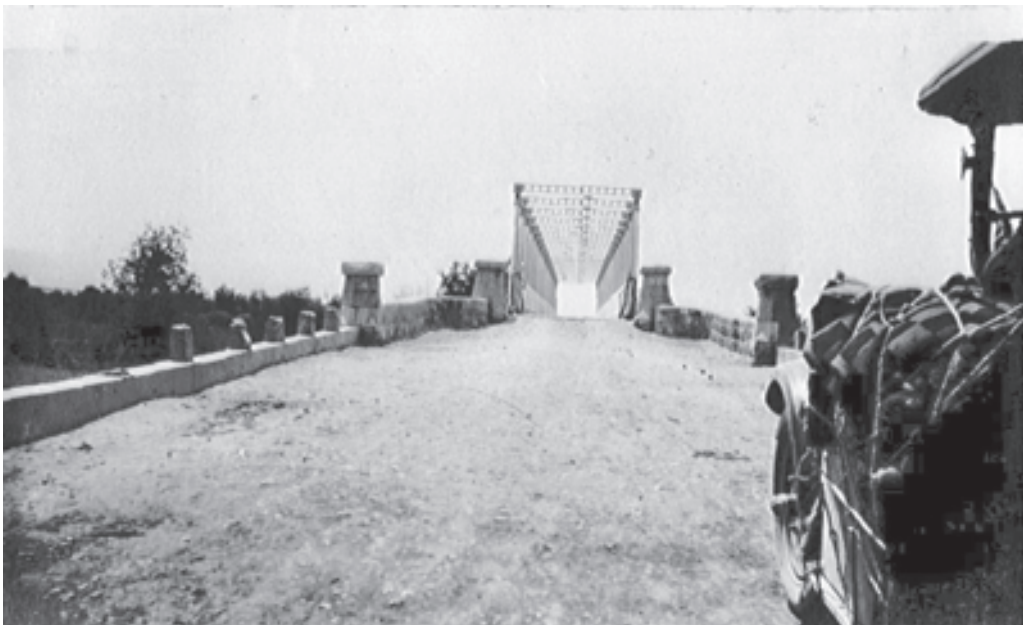
An early British photograph of the Jordan bridge near Jericho. 6