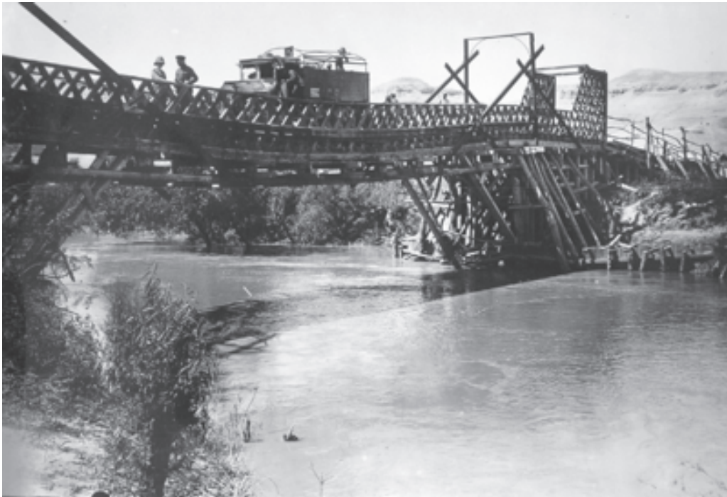
This bridge looks like the Damya Bridge as it appears in a German photo collection, 5 rather than the Shueib Bridge (later called Allenby) near Jericho.