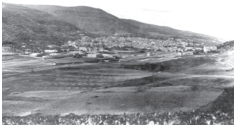
Panorama of Nablus with the unfinished railway station in the foreground.

The photograph of the Tulkarm station is followed by a view of Nablus. Today only few remember that Nablus, too, had a railway station at the time of World War I. In this photograph the unfinished station can be seen as a one-storey house with a gable, still unroofed.