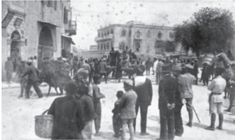
The German Headquarters ("Etappe") in Aleppo.

Aleppo to Damascus and every German soldier went to see the famous sun temple. Next is an aerial view of Rayak, the junction station to Beirut or Damascus. A photograph of the main street of Damascus is followed by a view of Haifa and the railway station of Tulkarm.