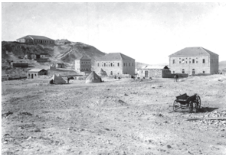
The Hafir complex in Canaan’s album. The buildings were used as hospitals. The building on top of the hill was unfinished.